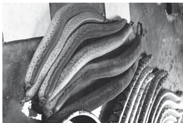
Fig. 5. Filesnakes Acrochordus javanicus filled with water before the skin is removed.

As a result, harvest and export continue to greatly exceed quotas, and according to many individuals involved, this has resulted in significant local declines in traded species, indicating that harvest levels are unsustainable. Although