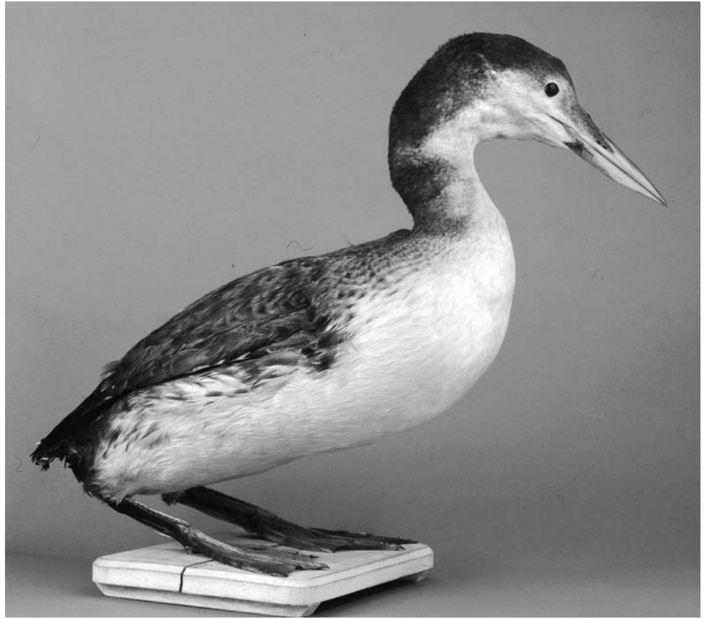
Fig. 1 Hybrid diver ZMA 54666 ( Gavia adamsii × G. immer ), obtained near Amsterdam (Netherlands).

Canonical Discriminant Function (CDF) analysis, for a set of continuous characters. In the first analysis, the 15 characters were each checked for significant sexual or age-related differences. If these were apparent, comparisons with ZMA 54666 (a first-year male in non-breeding plumage) were restricted to the relevant classes (e.g. first-year males only, all birds excluding breeding adults, etc.). In adult males, adult females or first-year females,