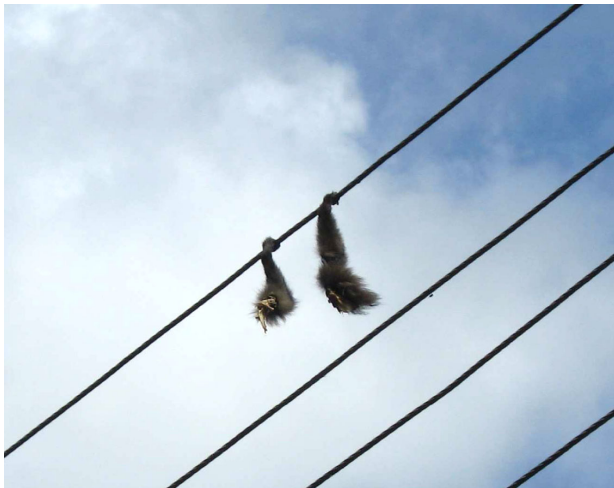
Fig. 3. Trachypithecus vetulus nestor . Remains of an adult male langur killed whilst crossing its habitat on a power line at Talangama Wetlands

Our study is complementary and builds on those recently published by Rudran (2007) and Nahallage et al. (in press). There is a great deal of agreement